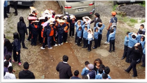
Students during an earthquake drill.

During June, we also experienced two of the strongest earthquakes in this area in a long time. Two quakes measuring 6.9 and 6.8 hit just a week apart and there was minor damage in Antigua