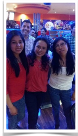
A few of the teachers during our Teacher's Day Celebration.

Teacher's Day was then followed by a week off. It was a mid-year break and a chance for both the teachers and students to refresh and come back re-energized.